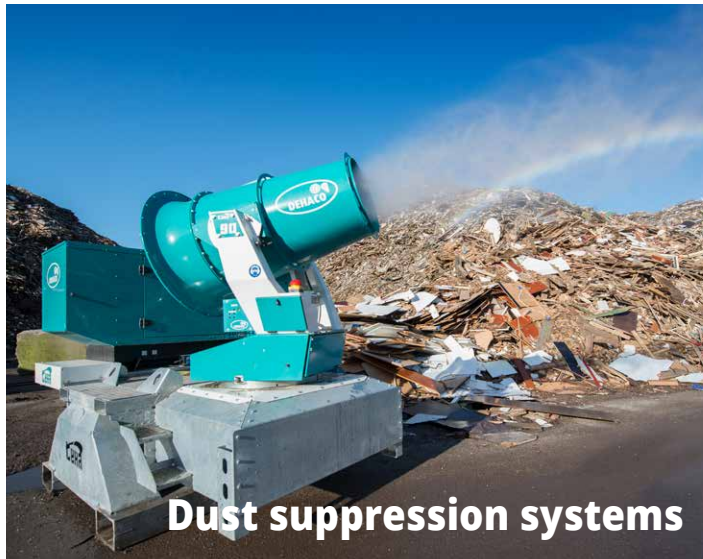
Dust suppression systems